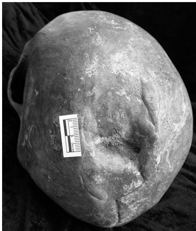
Fig. 2. A massive depression fracture can be seen on the left parietal of a Sortebrødre cranium, and a radiating fracture extends to the occipital bone. It is one of the most severe injuries that had healed.

As in all archaeological samples, the Danish skeletons were often incomplete. To be included here, the frontal and both parietal bones had to be present. That facilitated the recognition of healed fractures because the three bones had to be intact, hence well preserved. Ten frontal bones had fractures, and the