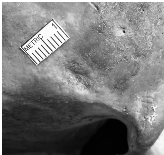
Fig. 1. A shallow depression fracture is present on the right side of the frontal bone in this Sortebrødre cranium. It is typical of the minor injuries seen on cranial vaults.

Turning to the skeletons, trauma frequencies in the three samples are not significantly different from one another ( \chi^2 test, P > 0.05 ). The same is true when cemetery-of-origin and age-at-death are explanatory variables in a logistic regression analysis.